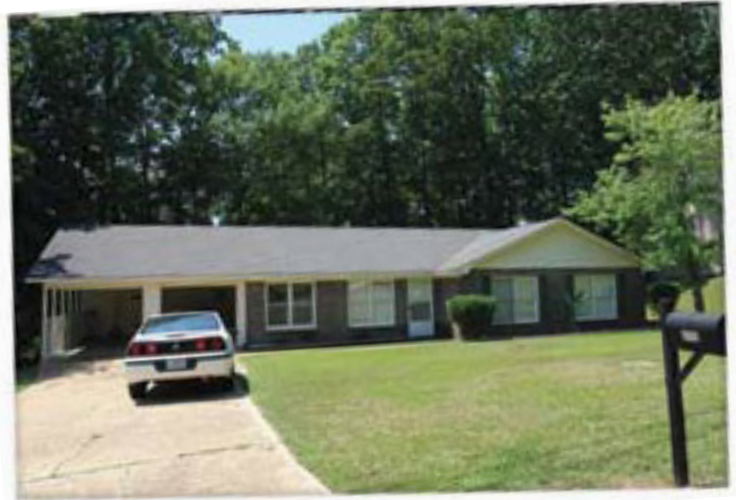
Typical home in the community in Alabama

and regulated by the Alabama Department of Mental Health (ADMH). The settings are overseen and monitored by a variety of state and federal agencies. ADAP's experience monitoring community settings is valuable part of the effort to ensure appropriate services and supports, health and safety, and overall welfare of the individuals residing in community settings. Currently ADAP utilizes students with special training and individuals with disabilities to assist with monitoring. However, additional personnel and resources are needed to continue this effort.