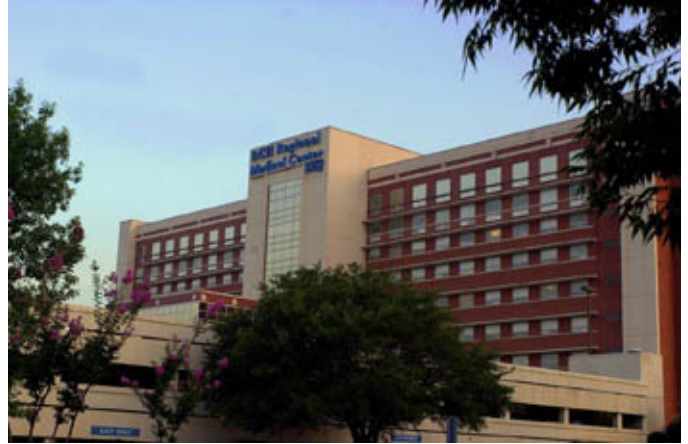
Hospital in Tuscaloosa, AL